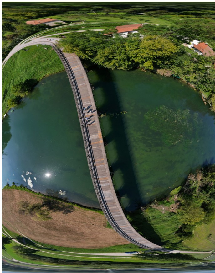
Drone photosphere of natural environment around Aquatika