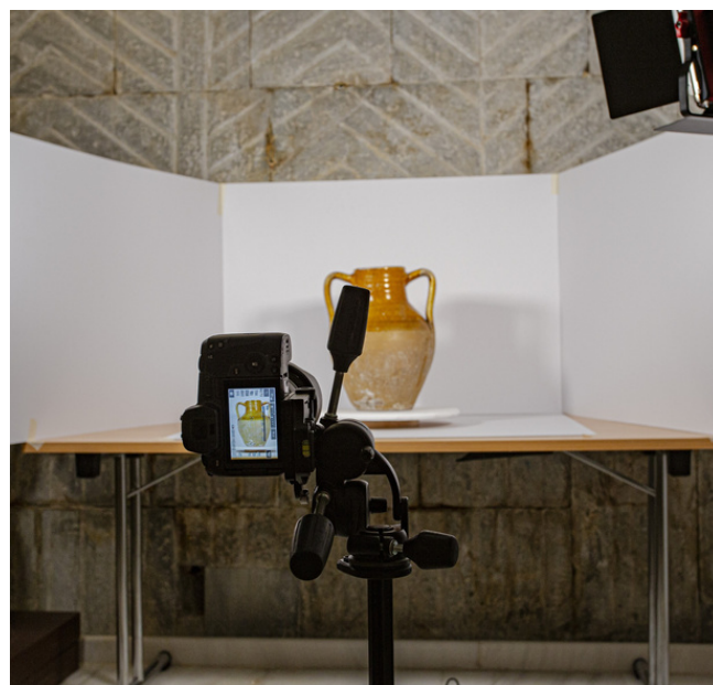
Digitization campaign works in the premises of MIO-ECSDE in Athens for HYDRIA's water jars collection